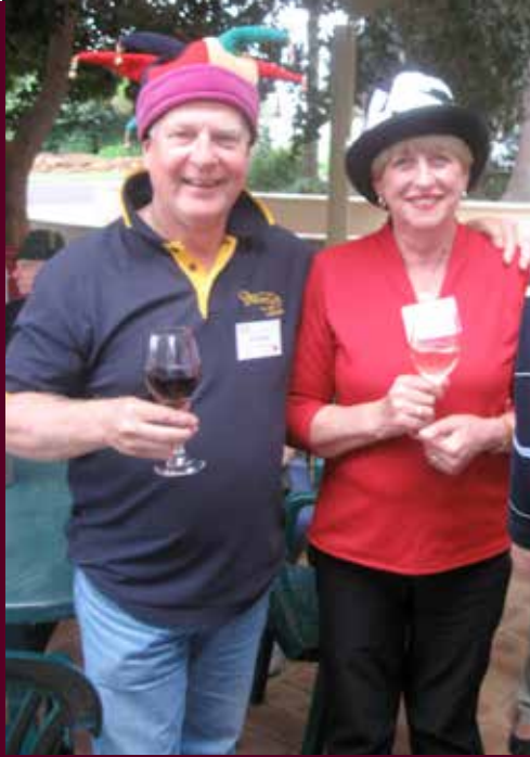
Couple of Victorian beauties