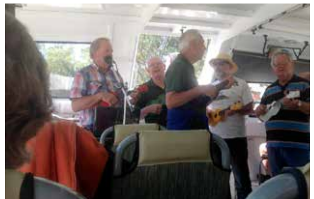
Cruise entertainment at great expense