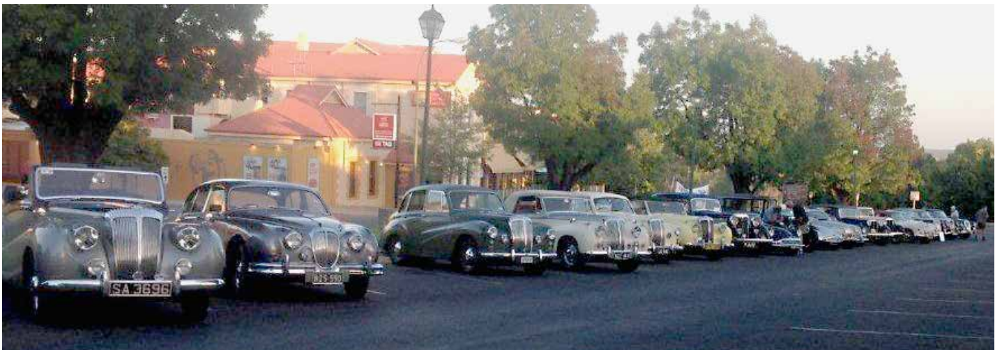
Main street display