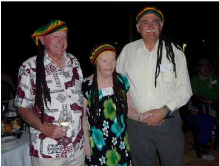
Job lot on hats and hair at local op shop