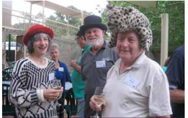
Welcome barbecue festivities