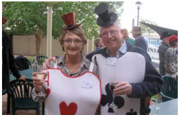
Hunting for a couple of wild cards