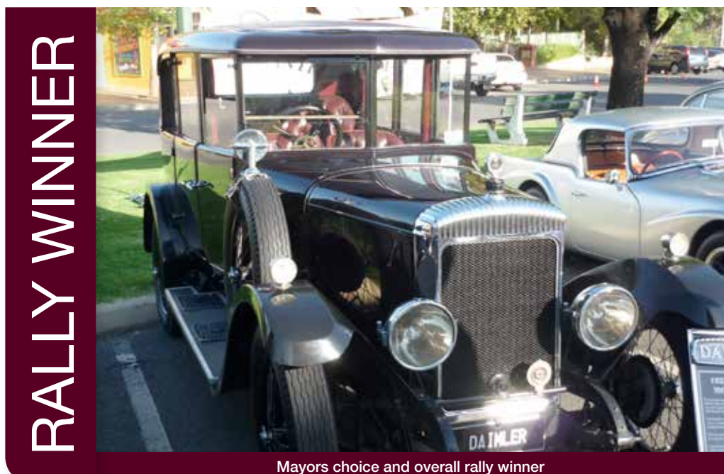
Mayors choice and overall rally winner