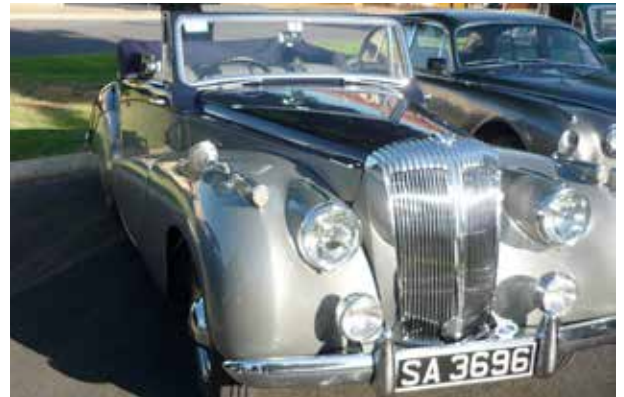
Michael Pringle's car after repairs

Next morning, as there was only a short trip to take to Loxton I took the opportunity to have the Special Sports checked and to have the brake connecting rod which had come adrift replaced and the brakes adjusted. The mechanic, a super guy also found loose nuts and bolts where the prop shaft was attached to the differential and the rear shock absorber mountings so having all that done made a huge difference to the car and apart from David Flynn nipping up a loose carburettor float bowl some days later my car did not suffer from other mechanical problems. The flat tyre will be mentioned later.