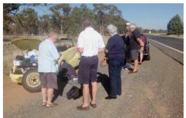
Running repairs with team participation