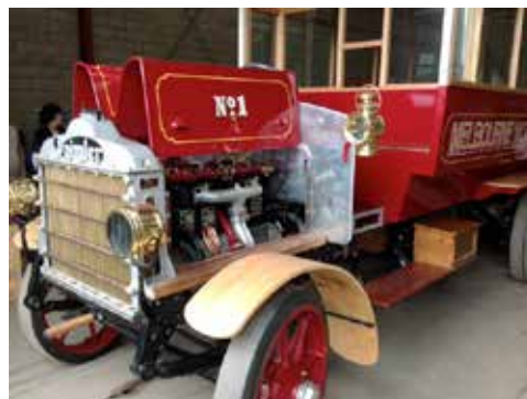
Malcolm for details as all I recall is that it is a sleeve valve motor and they had to make new sleeves