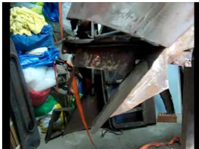
Figure 5 - When all rusted panels are removed very little remains