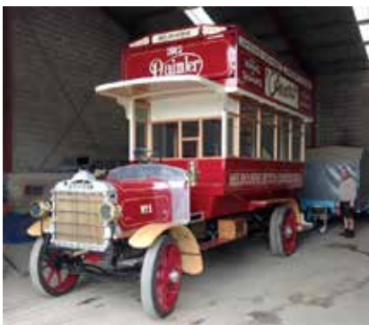
1912 Daimler Bus owned and restored by Malcolm Nixon of Wagga Wagga

The itinerary for the National SP250 Rally conducted from 30 November to 2 November included a visit to Nixon Engineering in Wagga Wagga to meet Malcolm and view the bus.