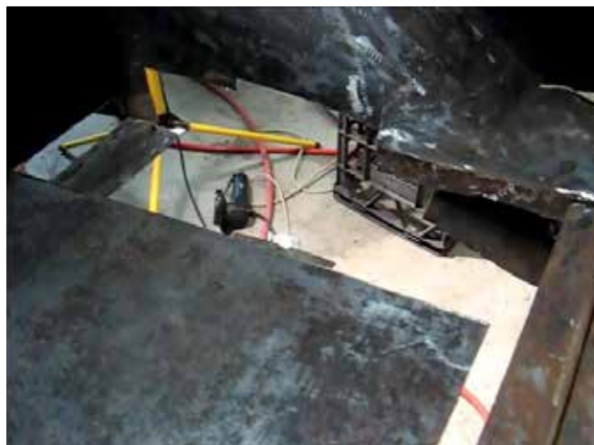
Figure 6 - Large section of spare tyre well floor had to be removed