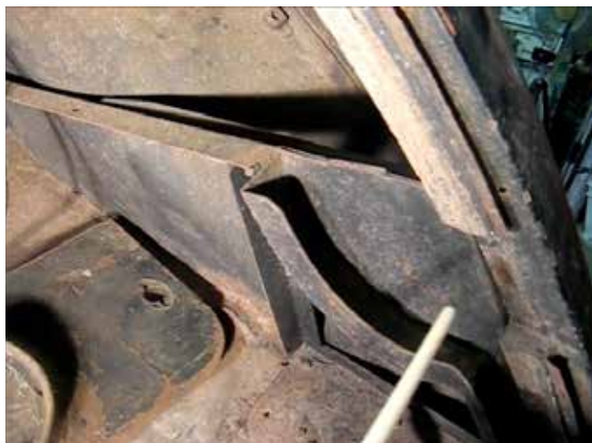
Figure 3 - Spare tyre well floor rusted through under mounting for suspended the boot floor