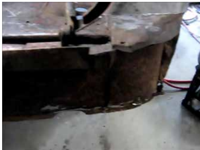
Figure 4 - Outer rear panels removed revealing rusted inner panels