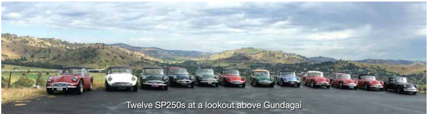
Twelve SP250s at a lookout above Gundagai

The itinerary for the National SP250 Rally conducted from 30 November to 2 November included a visit to Nixon Engineering in Wagga Wagga to meet Malcolm and view the bus.