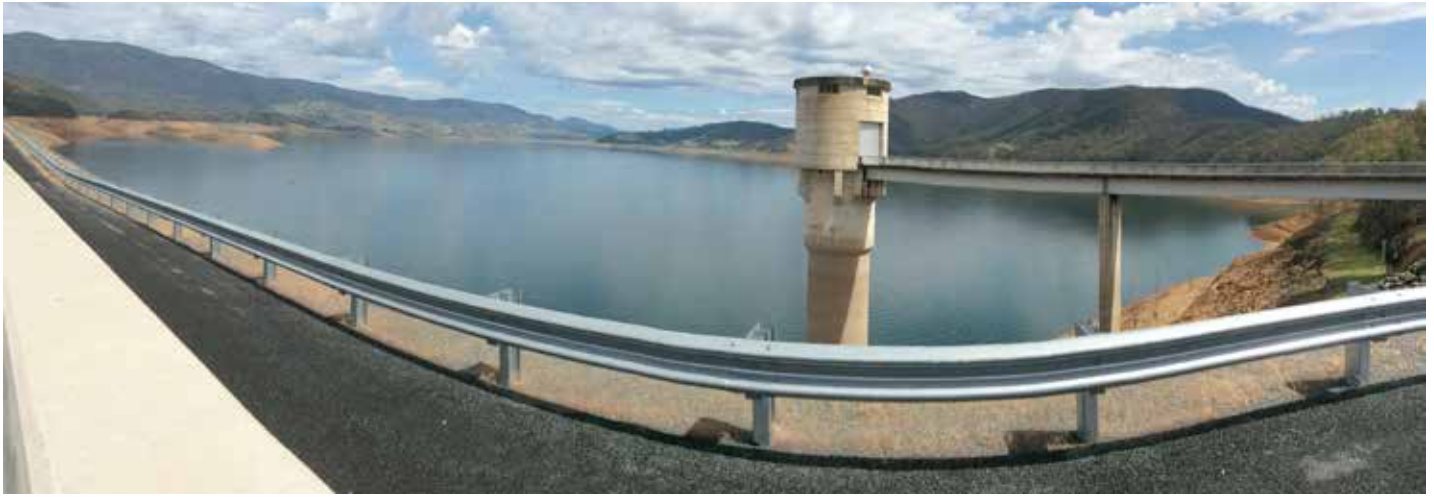
This is Blowering Dam visited on Sunday morning. At last some sunshine.