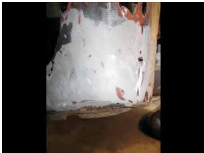
Figure 1-Rear side panel has previous repair but rusted through