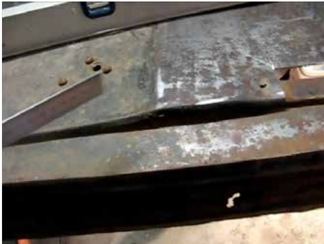
Figure 7 - Tyre well floor bowed upwards and needs straightening

Rust damage in the rear is quite extensive and largely created by the absence of a weather seal between the boot lid and tyre door.