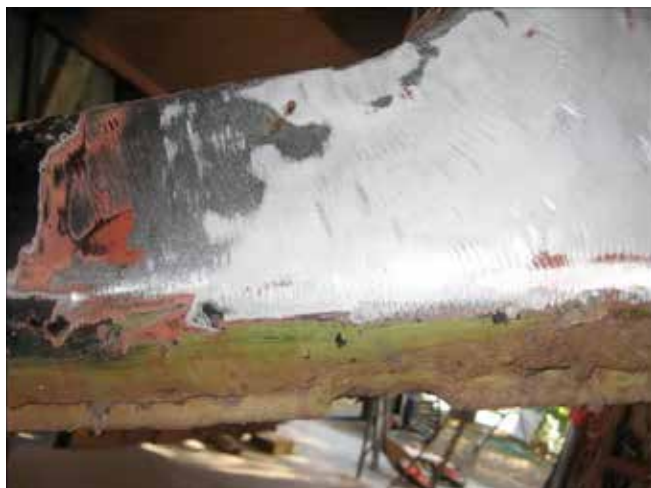
Figure 2 - Panel across car rusted through along bottom edge