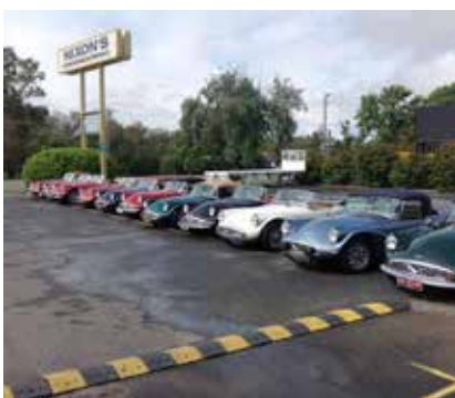
SP250s at Nixon Engineering during 2015 SP250 National Rally